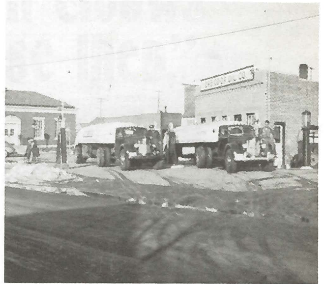
The trucks at Burwell, Nebraska

"On one trip we blew a tire and had no money for another one. We were in trouble. We talked to a man at a filling station near the Port of Entry in Kansas. We wondered if we could charge a tire. He asked us a few things about where we were going and what we were doing. He finally charged a tire to us, and we got home and collected on that load. We had so little money to