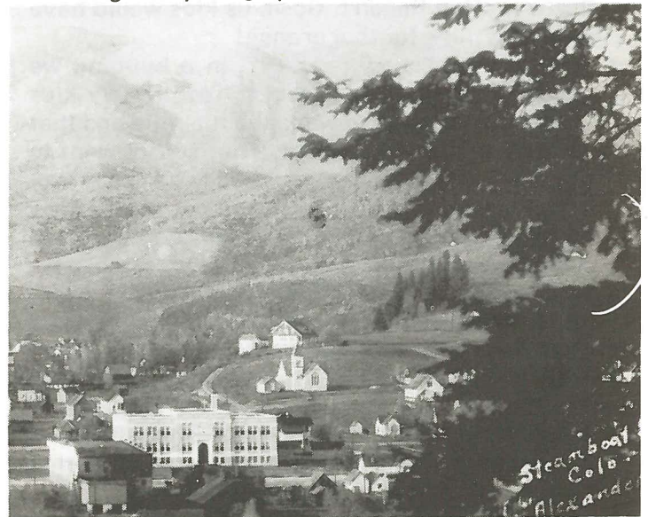
Steamboat Springs when Forrest first came