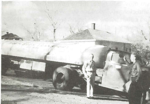
The old International